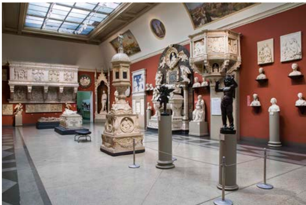
1 Renaissance Hall in the Pushkin Museum, Moscow, with plaster casts of Italian sculptures of the 15 th century. Four of the five busts on the right are casts of works from the Berlin sculpture collection.